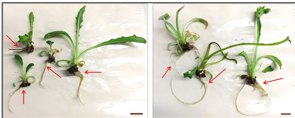
Figure 3. Rooted plantlets belonging to Sakız OP cultivar (bar = 1.0 cm)

While the micropropagation was in progress, the acclimatization of in vitro rooted plantlets to the in vivo conditions was also carried out. For this purpose, in vitro rooted plantlets (Figure 3) were transplanted into plastic trays containing peat: perlite (1:1) mixture. Plastic trays were covered with polyethylene cover during 10 days. The plantlets were watered twice a day. During 30-40 days of acclimatization process observations were made on plantlets and at the end acclimatization period surviving plants were transferred to the field.